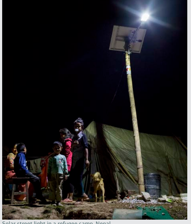
Solar street light in a refugee camp, Nepal