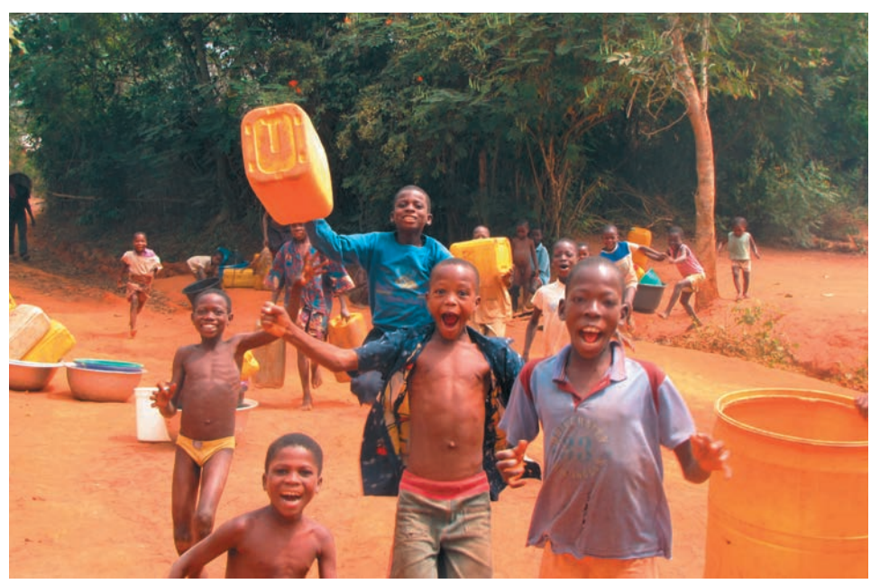
Happiness at water spouting from a solar pump in the village of Gbovié, Benin

Electriciens sans frontières, a registered charity and NGO, conducts projects for access to electricity and water so that the poorest people in the world have sustainable access to energy that is as efficient, affordable and clean as possible.